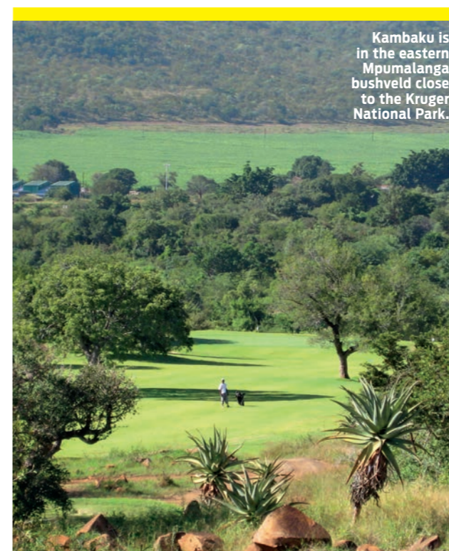
Kambaku is in the eastern Mpumalanga bushveld close to the Kruger National Park.

Vulintaba Country Estate is 20 kilometres from Newcastle in Northern KZN; Green fee R100 (9) or R160 (18). Par 72. Opened in 2009 as Dunblane estate, with the original layout by Peter Matkovich. Substantially changed last year by DDV Design for the new owners. This is a proper golfing challenge, with superb holes in a magnificent Drakensberg amphitheatre.