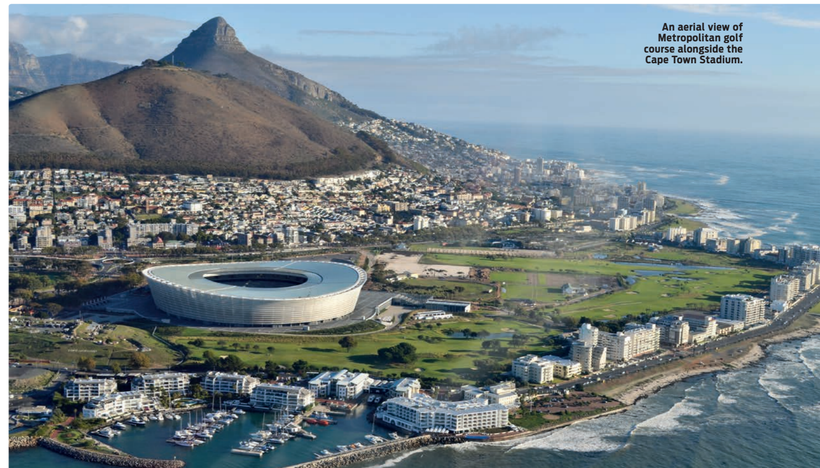
An aerial view of Metropolitan golf course alongside the Cape Town Stadium.

Above all, our knowledge of 9-hole courses is nowhere near complete. We'd like to hear your views about the 9-holers you're familiar with. Have we overlooked a special gem that we ought to be informed about? Email and let us know the 9-holers that you particularly care for.