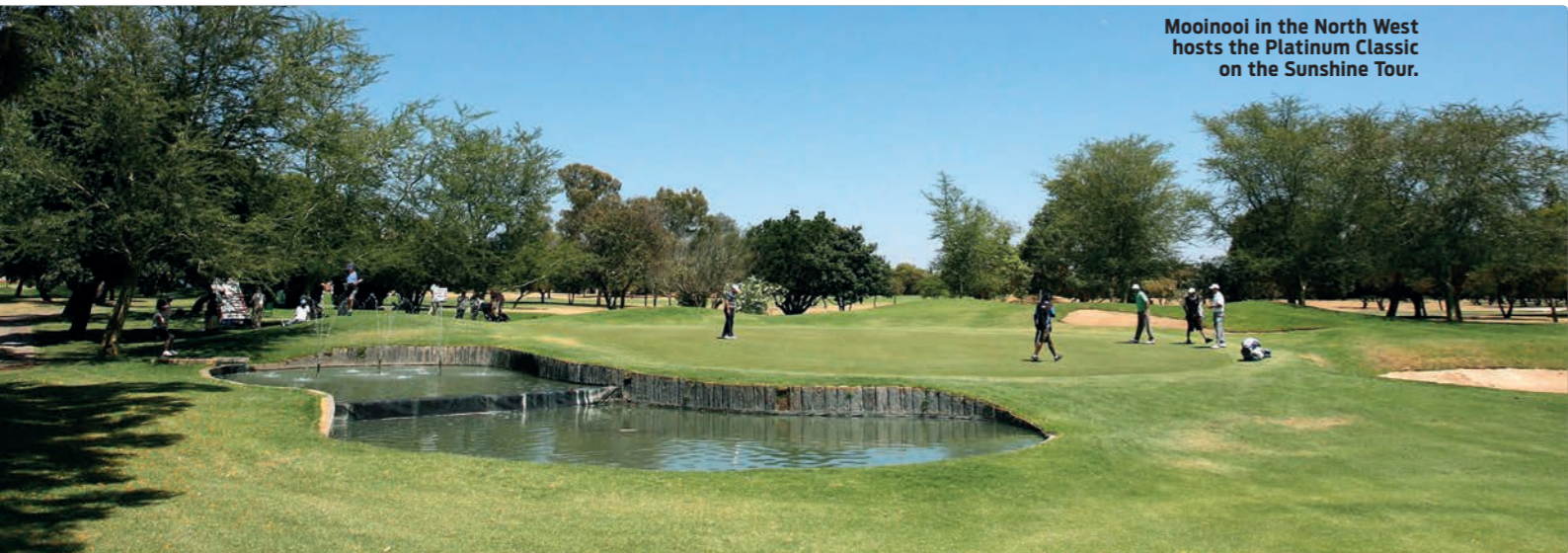
Mooינווי in the North West hosts the Platinum Classic on the Sunshine Tour.

layout (6 000 metres), five kilometres outside town, on the Sundays River, with views of the surrounding mountains. The club itself was founded in 1897, and its two previous courses both had sand and oil greens. A regular water supply enabled the club to grow kikuyu on the fairways, and plant Bayview on the greens. One of South Africa's most famous historic golfers, Douglas Proudfoot (1860-1930), lived in Graaff-Reinet, and the golf club hosts a 3-day Proudfoot festival in March.