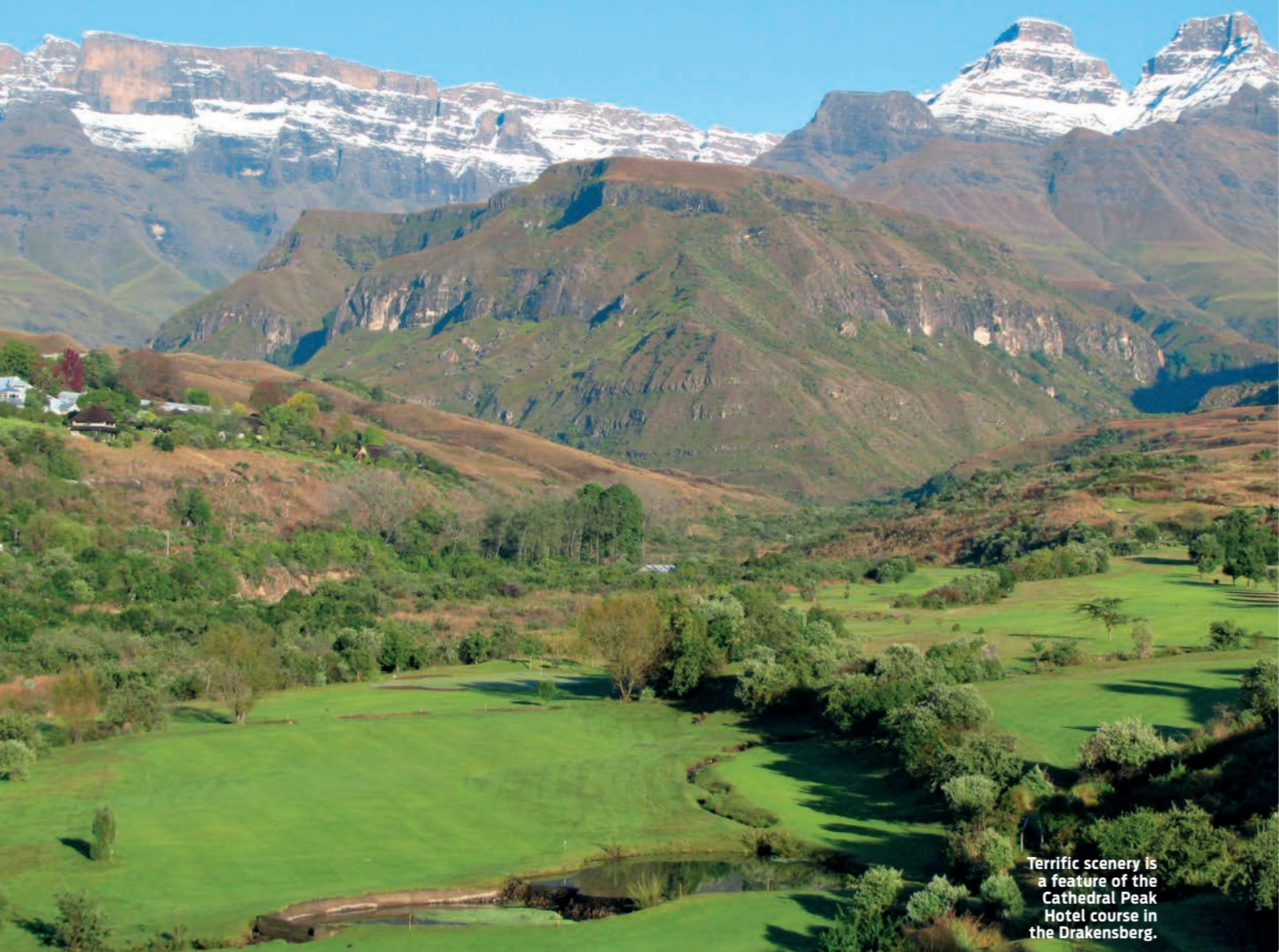
Terrific scenery is a feature of the Cathedral Peak Hotel course in the Drakensberg.